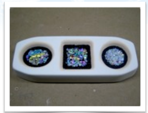
Fire using the following schedule: